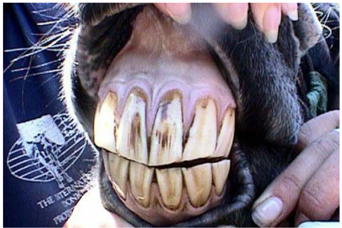
Fig 3.0 Normal ventral curvature of the incisors

Ventral curvature of incisors has 97% prevalence in donkey's; it is thus recognised as normal anatomy (Du Toit et al., 2009). If incisors are of normal length, and cheek teeth occlusion is good, attempts to rectify the ventral curvature will usually result in a loss of incisor occlusion and is undesirable. In certain cases the donkey may completely wear out either incisor arcade (although more commonly the maxillary incisor arcade is affected).