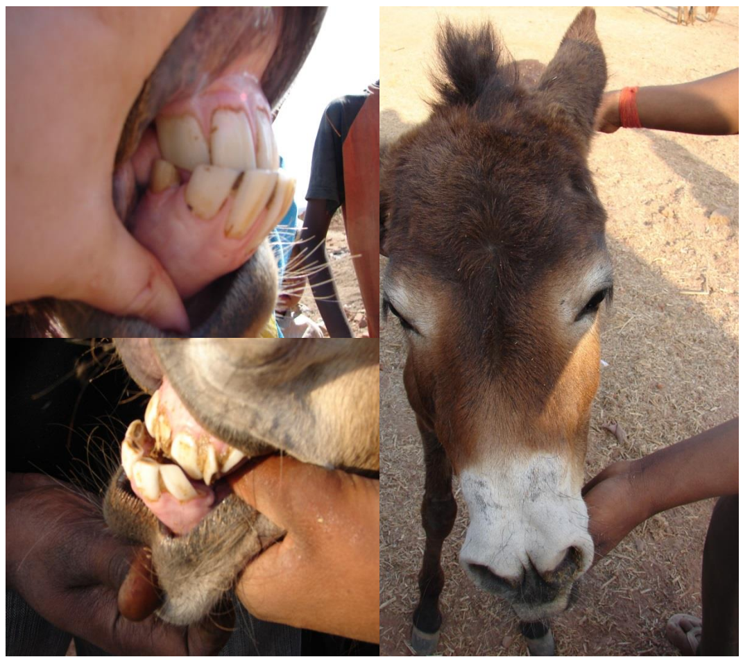
Fig 2.0 Facial deformity of the Nepali mule and consequent dental malocclusions.