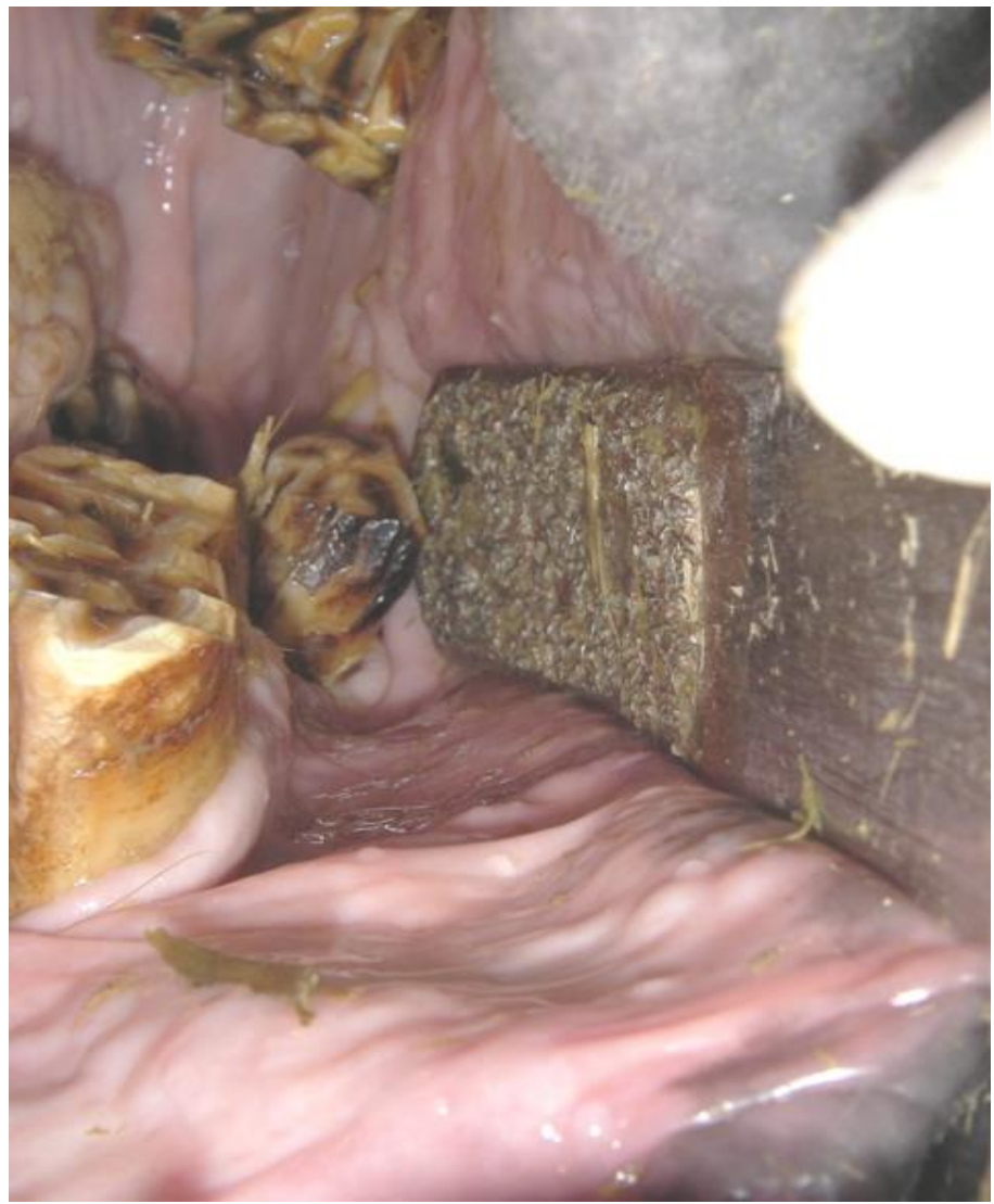
Fig 4.0 Typical molar displacement

Multiple extractions in a singular session should be avoided wherever possible as the sudden reduced function in addition to stress, and possible pain and potential infection will cause acute inappetence. Consequently there is a likelihood of rapid onset hyperlipaemia which carries an extremely high fatality rate. Extractions should always be staged if the affected teeth are on contra-lateral arcades, as it is beneficial to leave the donkey with one pain free side on which to eat. On occasion the practitioner may observe digitally loose cheek teeth that are only held in occlusion via the mesial compression of the arcade. The general advice regarding extractions is to extract those teeth deleterious to health, to do so in stages and with appropriate veterinary intervention. For veterinarians performing extractions; the use of regional analgesia is strongly advised should periodontal attachment be more than negligible.